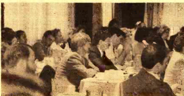
Students learn "one-on-one" organizing technique.