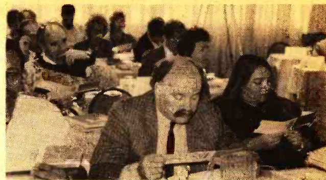
Canadian delegates examine management's campaign materials.