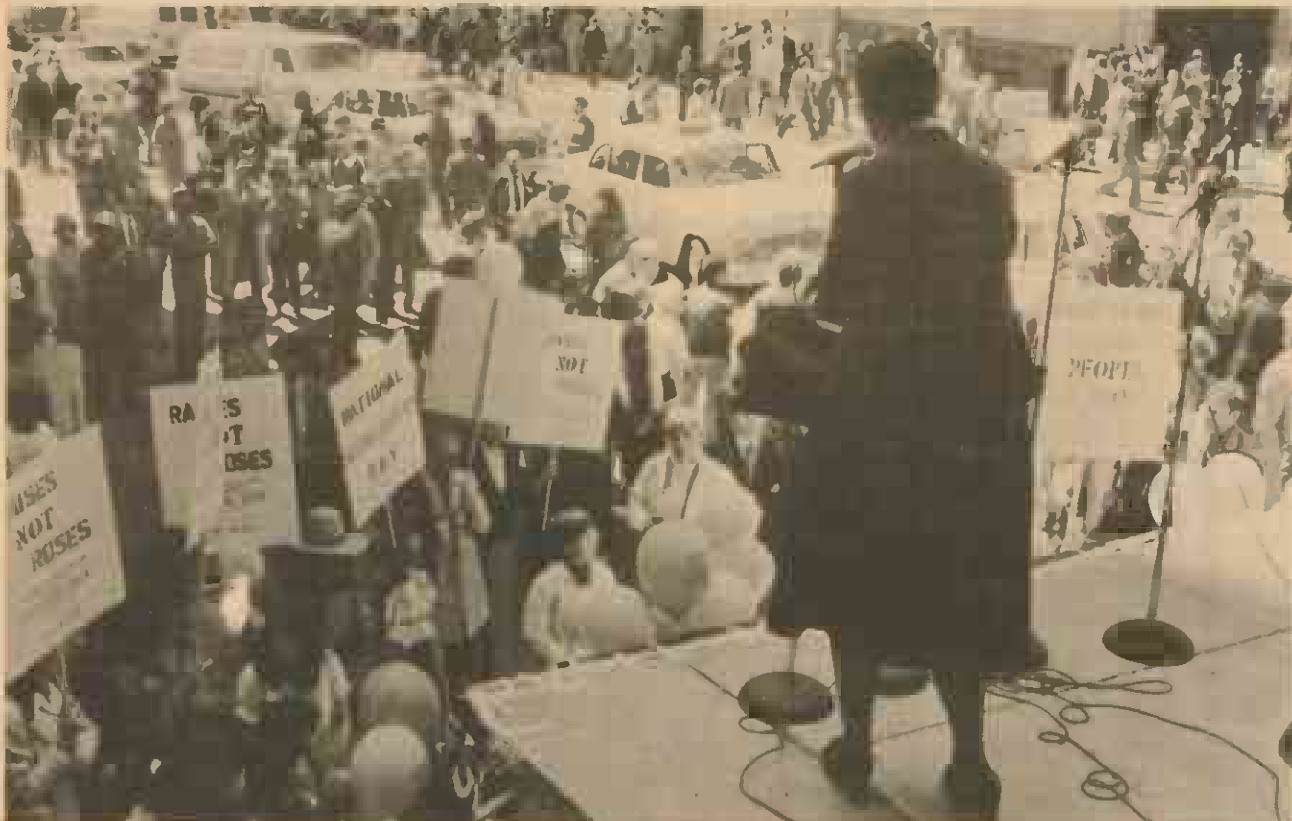
Secretaries rally on Wall Street.