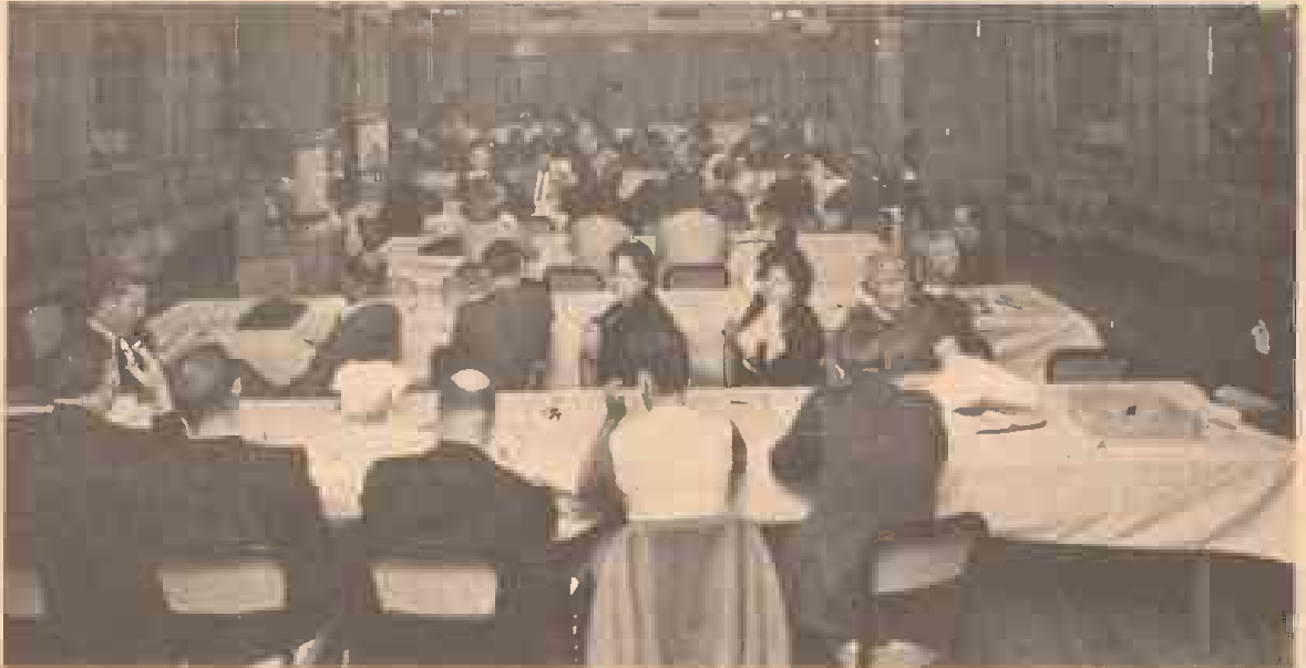
The Northeast Educational Conference was held last month in Washington, D. C., March 14-15.