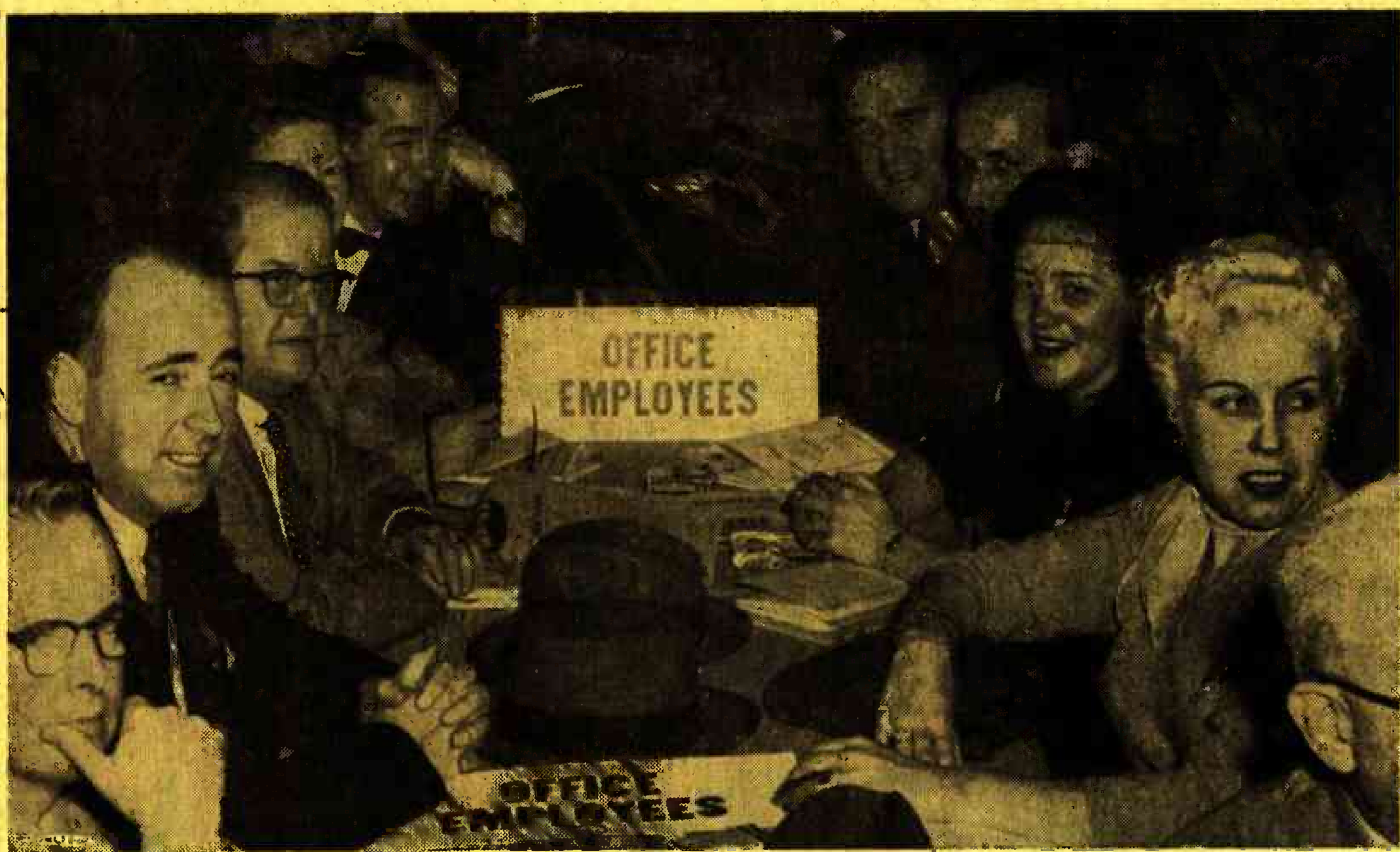
Above is a picture snapped at the recent convention in New York City of the Office Employees delegates during one of the sessions.