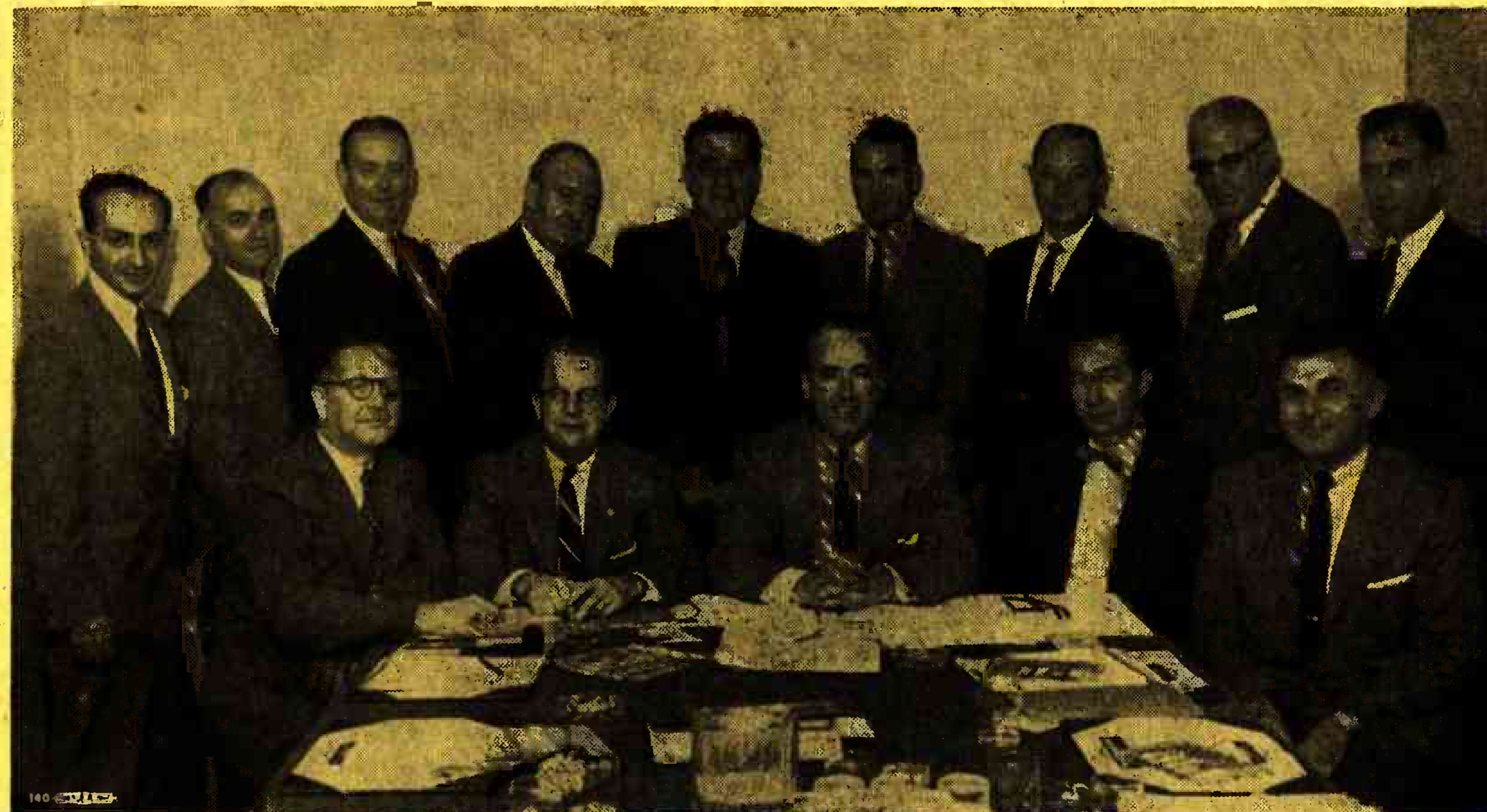
Above is the OEIU International Executive Board at their recent meeting in New York City. The Board meeting was held at the same time as the AFL convention and the merged AFL-CIO convention. During this meeting the Board considered many problems developing as a result of the merger of the two great labor organizations in the United States. The Board issued an invitation to all CIO office workers to join in one great white collar union, the OEIU, AFL-CIO.