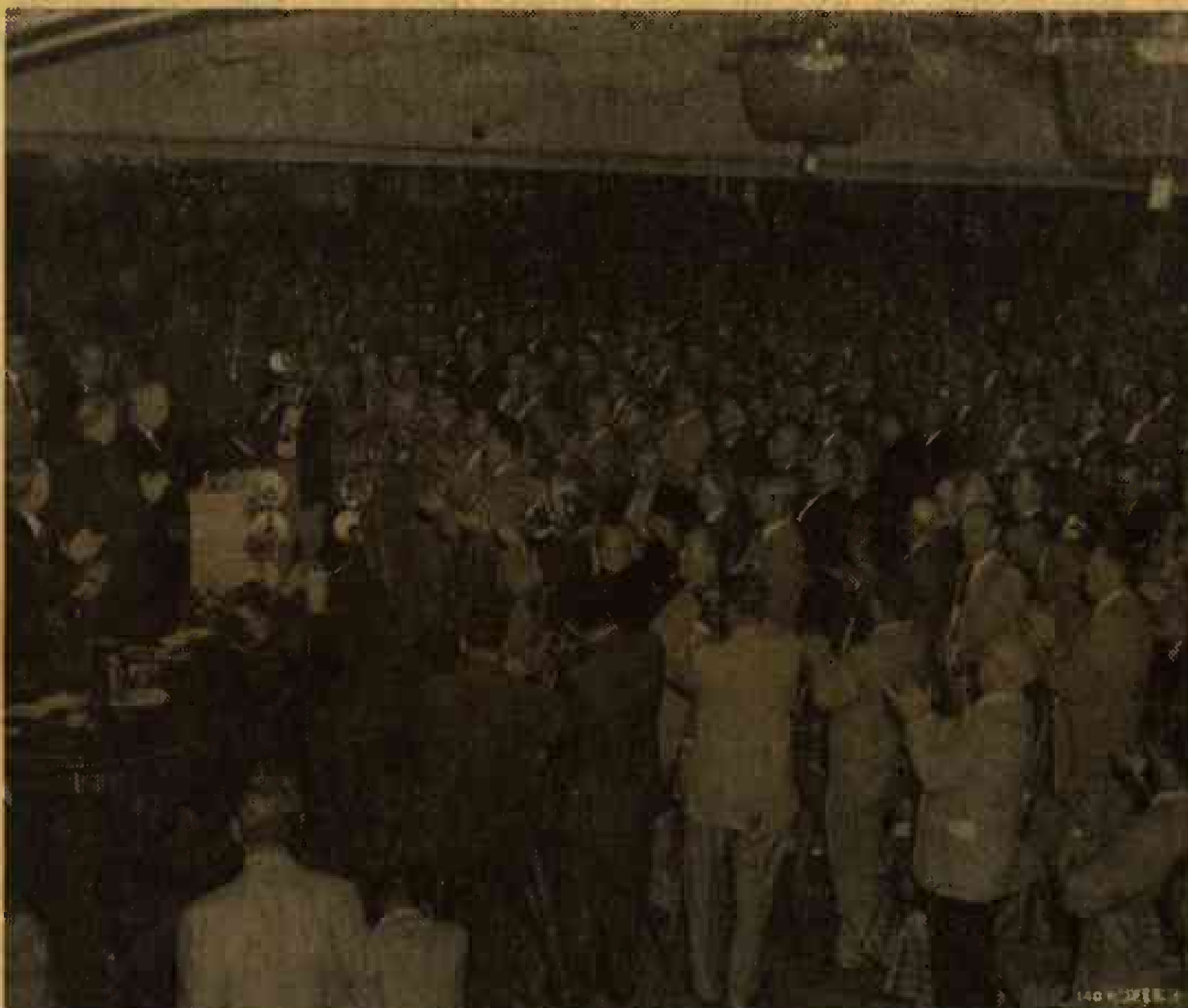
Delegates to the Los Angeles convention give a standing ovation to AFL President George Meany.