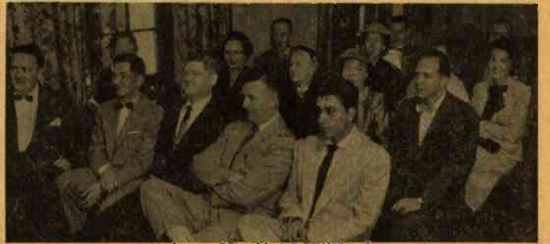
Here's part of the delegation that attended Northeastern Organizational Conference meeting September 12 in Boston, despite the travel snarl caused by Hurricane Edna.